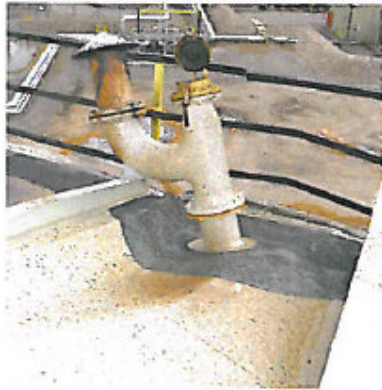
Damage to vent and roof